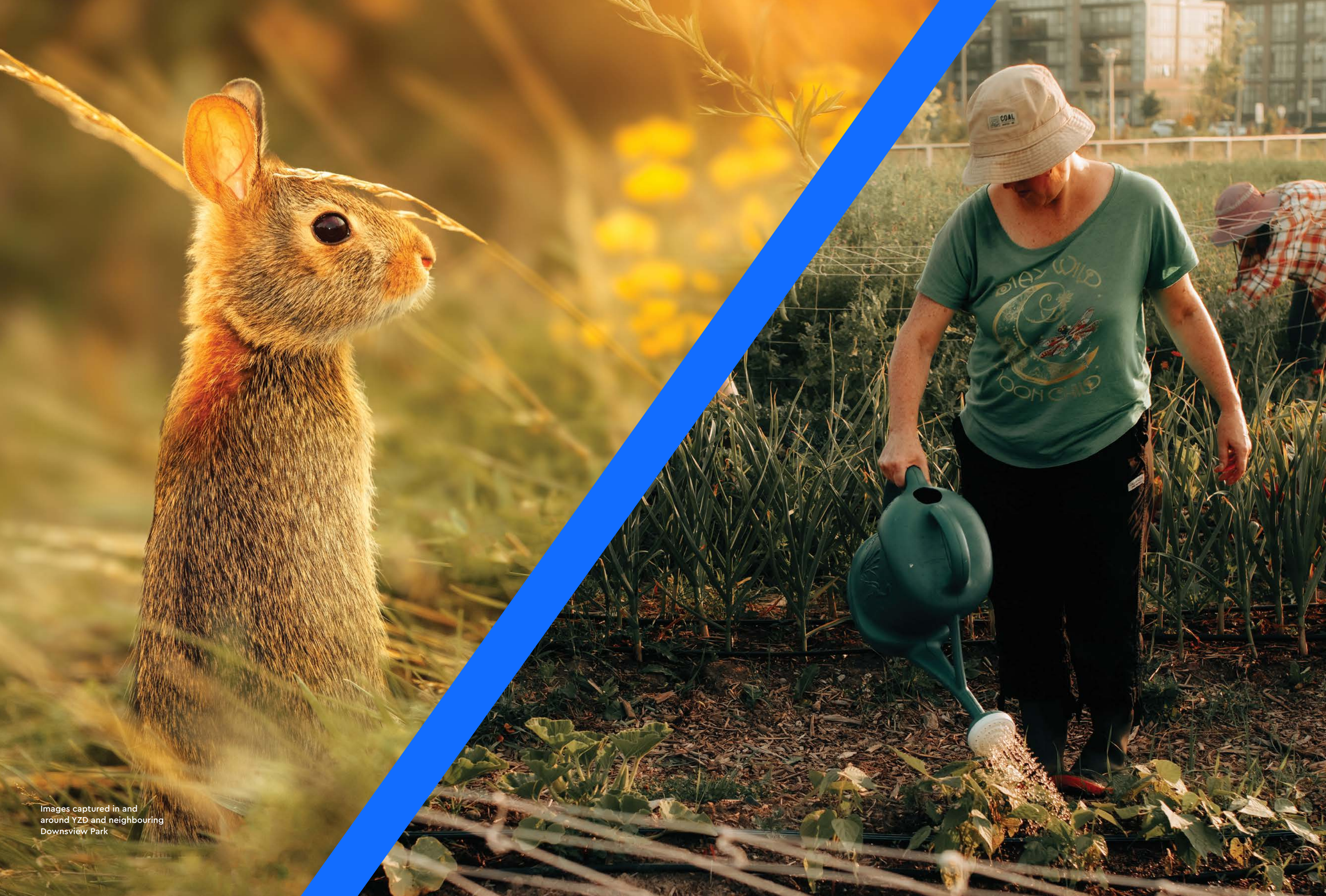
Images captured in and around YZD and neighbouring Downsview Park